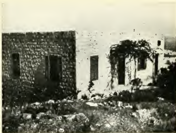
THE HOUSE WHERE ABDUL BAHÁ OFTEN STAYS ON THE SLOPE OF MOUNT CARMEL